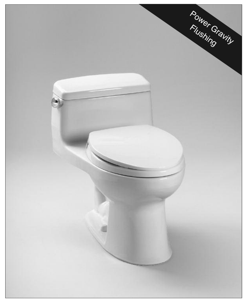
MS864114 / MS863113- Supreme Toilet with SoftClose Seat